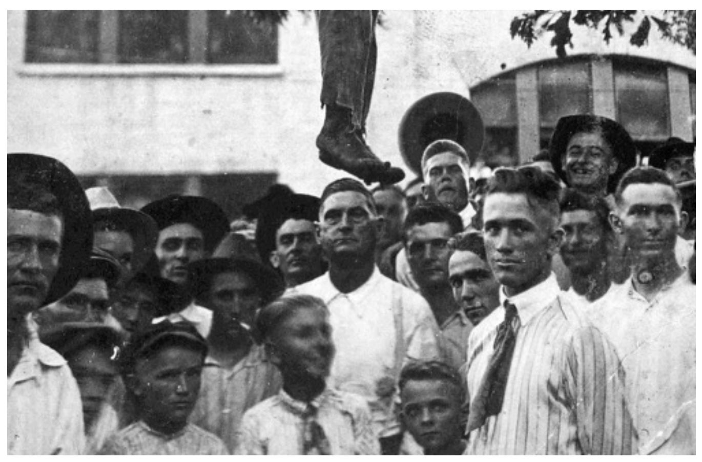
A postcard dated August 3, 1920, depicts the aftermath of a lynching in Center, Texas, near the Louisiana border. According to the text on the other side, the victim was a 16-year-old boy.

estimated to have brought in tens of millions of dollars to antebellum America. In 1860 there were more millionaires per capita in the Mississippi Valley than anywhere else in the country.