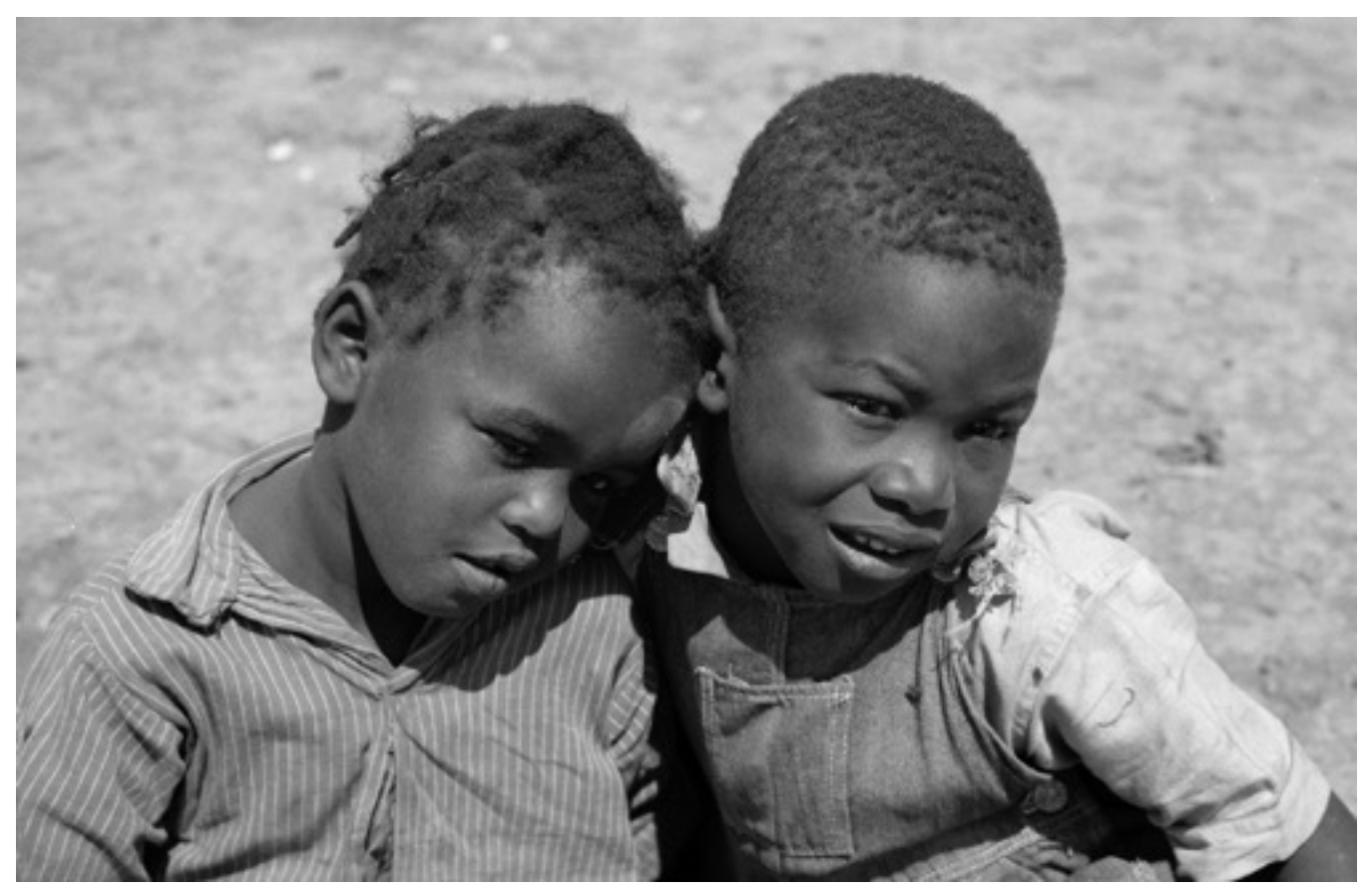
Sharecropper boys in 1936

program at their church. She ordered the suit by mail. But that year Ross's family was paid only five cents a pound for cotton.