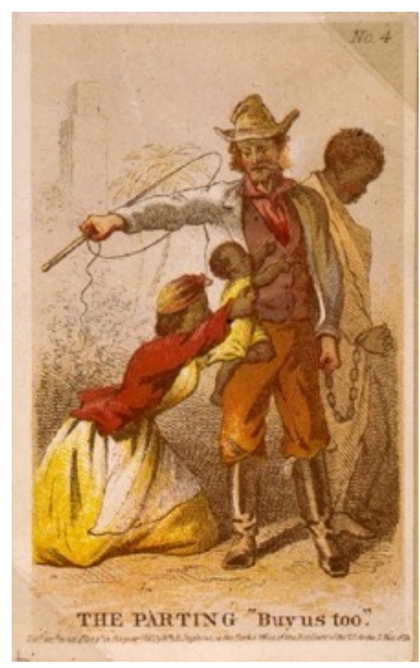
In this artistic rendering by Henry Louis Stephens, a well-known illustrator of the era, a family is in the process of being separated at a slave auction.

time, there would have still been people alive who could remember blacks and whites joining to burn down Jamestown only 29 years before. But at the beginning of the 18th century, two primary classes were enshrined in America.