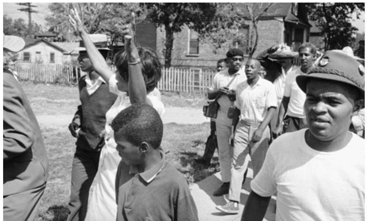
The September 1966 Cicero protest against housing discrimination was one of the first nonviolent civilrights campaigns launched near a major city.

Speculators in North Lawndale, and at the edge of the black ghettos, knew there was money to be made off white panic. They resorted to "block-busting"—spooking whites into selling cheap before the neighborhood became black. They would hire a black woman to walk up and down the street with a stroller. Or they'd hire someone to call a number in the neighborhood looking for "Johnny Mae." Then they'd cajole whites into selling at low prices, informing them that the more blacks who moved in, the more the value of their homes would decline, so better to sell now. With these white-fled homes in hand, speculators then turned to the masses of black people who had streamed northward as part of the Great Migration, or who were desperate to escape the ghettos: the speculators would take the houses they'd just bought cheap through block-busting and sell them to blacks on contract.